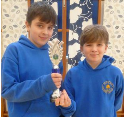
England – Running Trophy